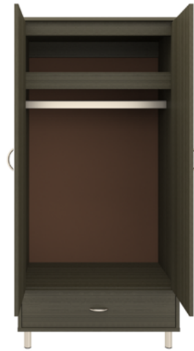
Model: A2WR12 34.75W 23D 71H

Taking on a new twist from an old classic, the Atlanta II re-invents itself by adding feet for a wonderful new design with tried and true appeal. Cleaning and maintenance are simple and easy when case goods are elevated. Available with or without contrasting edges as well as custom color combinations. The product is required to be wall mounted for safety. Using the kit provided, please follow provided instructions exactly.